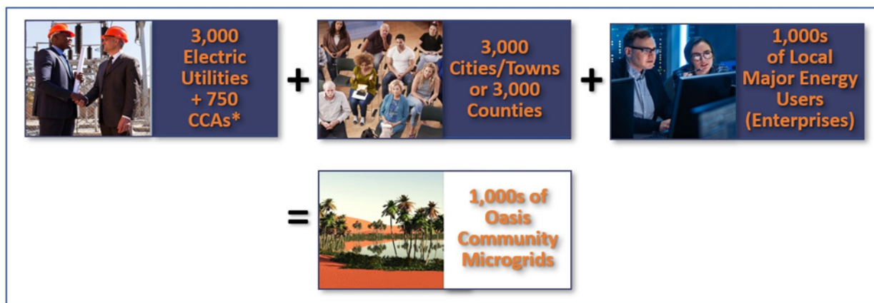
Figure 1. Potential Community Microgrid Market

This means that many collaborative projects are possible in the U.S. for a first community microgrid in each city or county. Once a city or county completes its first community microgrid and realizes its various benefits, the potential for additional community microgrids increases.