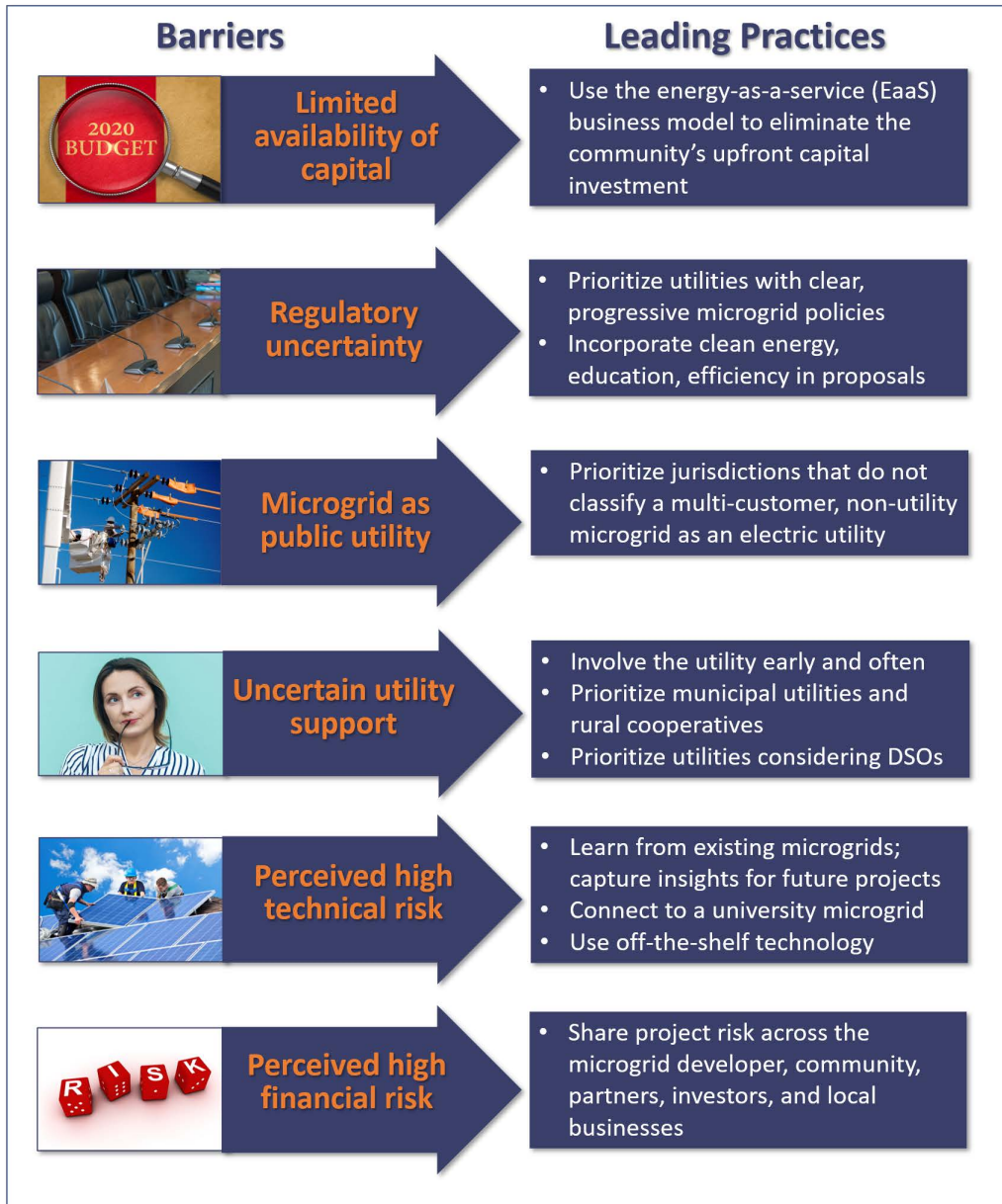
Figure 2. Summary of Community Microgrid Barriers and Leading Practices

Based on a review of successful (and some not implemented) community microgrids, following are leading practices for microgrid developers to consider when addressing microgrid financial, legal and regulatory barriers. Figure 2 summarizes the limitations and proposed practices.